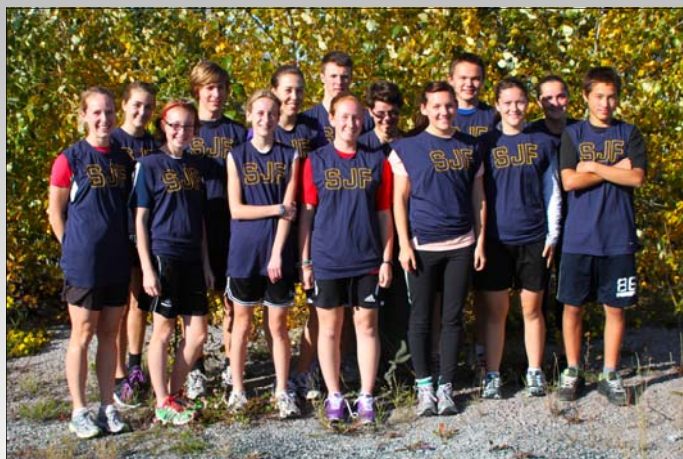
Sir John Franklin Cross Country Team